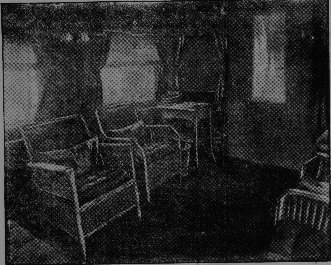
The C. P. R. Royal Train—Interior view observation car set apart for H.R. H. Prince of Wales on the "Kil-larney."