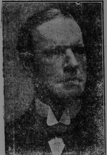
Hume Cronyn, M.P. for London who will move the address in reply to the speech from the throne when Parliament opens in February.

COATS $16.00 UP AT Andur's, 247 Union street, corner Brussels street, and 288 King street West. 1-16