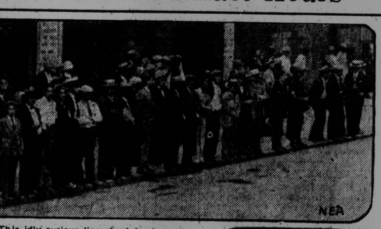
Waiting News of Valentino—This idly curious line stood for hours in front of Polytechnic Hospital, New York, on Rudolph Valentino's last morning. But a few minutes before the end of Rudy's fight, police came and shooed them away. In the background is Tex Rickard's new Madison Hotel.