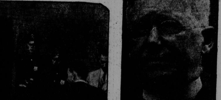
Leaving His Hospital—The body of Rudolph Valentino being placed in a hearse at the door of Polytechnic Hospital for removal to the funeral home.