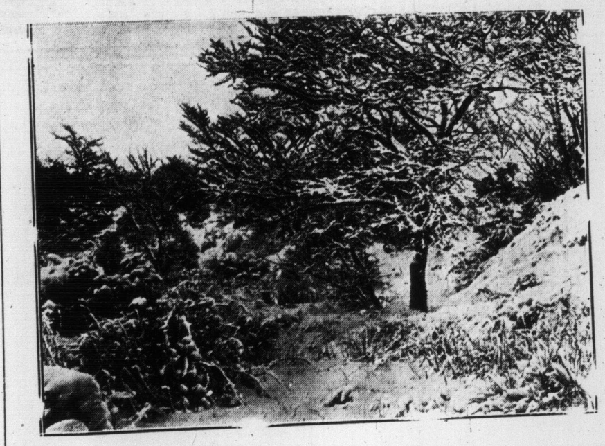
WINTER'S BLOSSOM-TIME: HIGH PARK. Beautiful woodland picture, as seen on the morning following the sleet-storm.