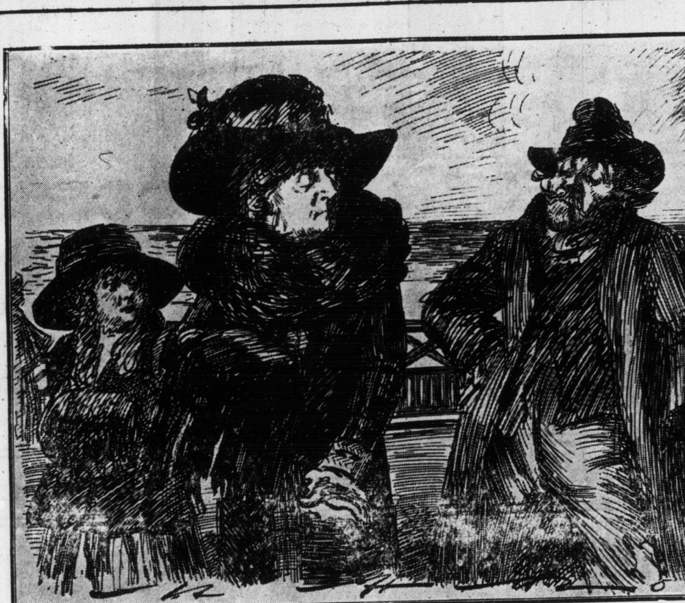
A SIMPLE REQUEST, SURELY. The Aristocrat: "No, go away; I never give to beggars." The Commoner: "Madam, you mistake; all I ask is the simple loan of an onion."