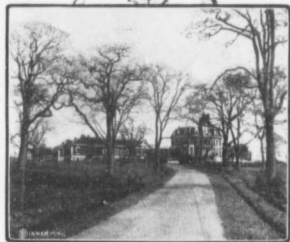
Provincial Royal Jubilee Hospital