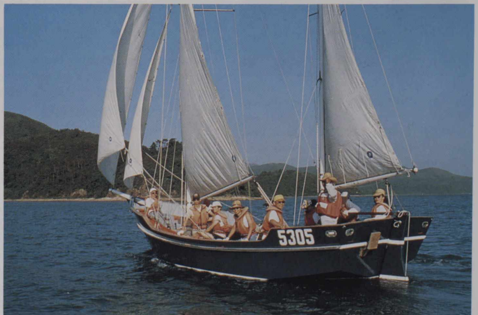
Challenges demanding teamwork help personal growth.