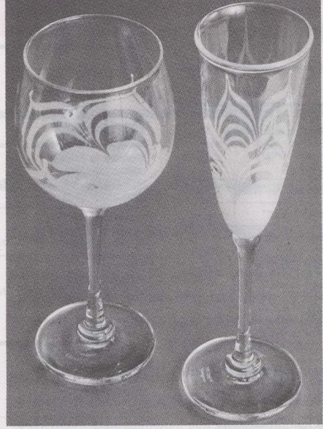
Wine goblets by Robert Held are decorated with swirls of white glass.

We've also held premières of Canafilms and staged a fashion show of