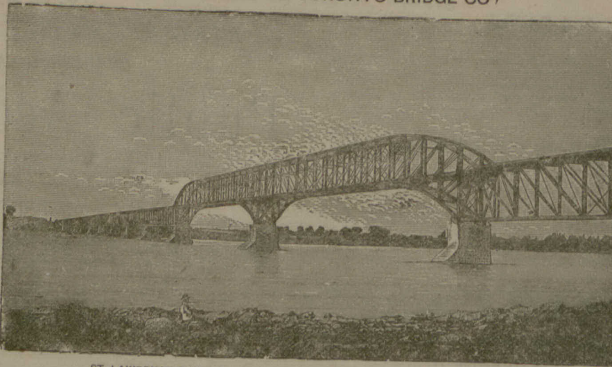
ST. LAWRENCE RIVER BRIDGE, CANADA PACIFIC RAILWAY, LACHINE, P. Q.

For Railways and Highways, Iron Bridges, Turntables Iron Piers and Trestles, Bridge Rods Right and Left Hand Sleeve Nuts and all kinds of Structural Iron Work.