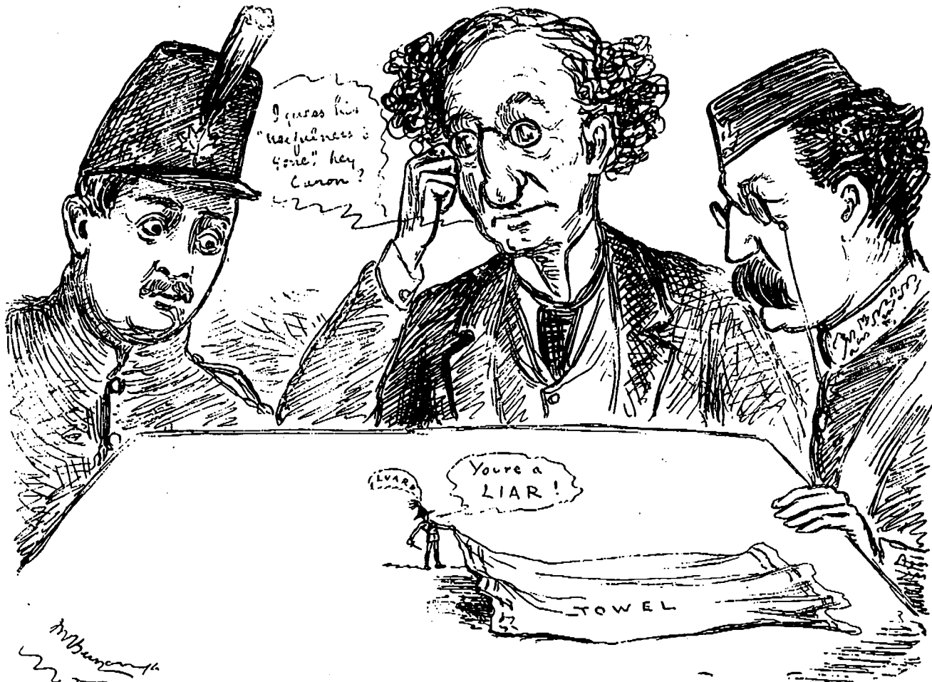
A MILITARY MIDGET! THE "SMALLEST" GENERAL IN THE DOMINION.

AT THE EXHIBITION. Toronto Globe (Sept. 11.):- "TYPE-WRITING." This comparatively new, but delightfully legible and rapid mode of writing is well represented in the Exhibition by Mr. T. Bengough, of Toronto, having sent up three machines, which were already being operated yesterday afternoon. These machines are rapidly growing in favor, and the present is an excellent opportunity for the public to thoroughly acquaint themselves with the invention and convince themselves of its advantages over the old, laborious, often illegible system of Caligraphy. See our exhibit—head of stairway, main building. If you can't come to the Exhibition, send for catalogue and specimens. BENGOUGH'S SHORTHAND ATHENEUM AND TYPE-WRITING HEADQUARTERS, 29 King Street West, Toronto.