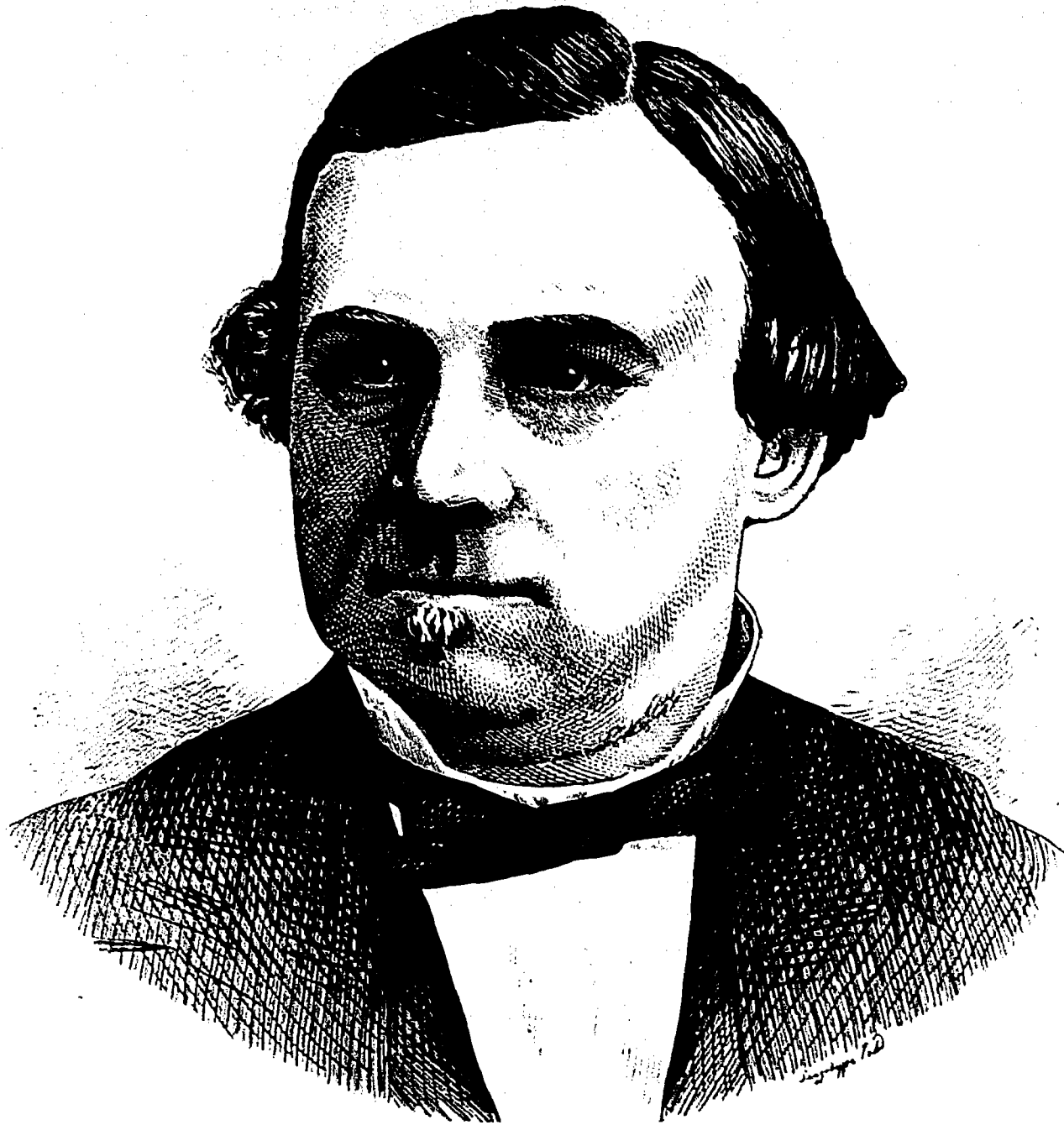
HON. H. L. LANGEVIN, Q. C., C. B.

In 1857 he entered the Legislative Assembly of Canada as member for the County of Dorchester, and continued to represent that constituency until the Union. At the last general election he was