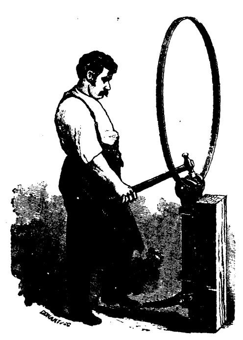
IMPROVED TIRE SHRINKER.