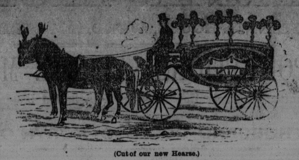
(Cut of our new Hearse.)