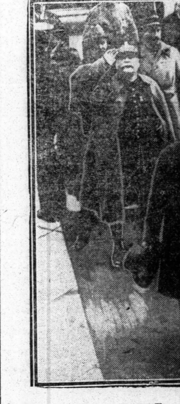
The picture shows the French Mission arriving in New York for the British Mission. Leading is M. Rene Viviani, Foreign Minister, on the arm of Joseph H. Choate. The reception was tremendous.

"PAPA" JONPRE SEES NEW YORK SKYSCRAPERS.