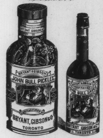
This is a facsimile of our bottles

"Worcestershire Sauce," "Yorkshire Sauce" "Devonshire Relish" Raspberry Vinegar, Evaporated Vegetables, Chocolates, Cocoas, Confectionery.