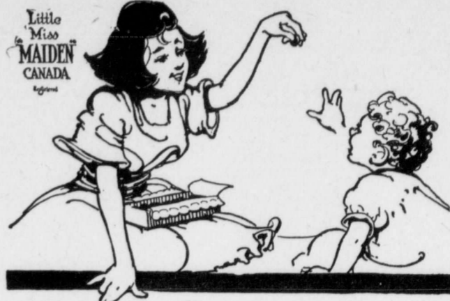
The Life of a Child

of the World" is seemingly resented by some of the "Supermen" over there, as well as those who have imbibed the cult of Sir Edwin Arnold and his Oriental school.—Philadelphia Standard and Times.