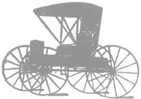
No. 10 Piano Box Buggy Price $57.00.

Jordison Bros., Auctioneers, P. O. Box 1172, Calgary, Alta.