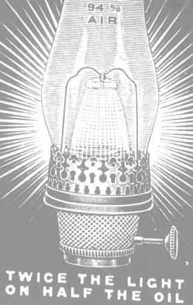
TWICE THE LIGHT ON HALF THE OIL

We don't ask you to pay us a cent until you have used this wonderful modern light in your own home ten days, then you may return it at our expense if not perfectly satisfied. You can't possibly lose a cent. We want to prove to you that it makes an ordinary oil lamp look like a candle; beats electric, gasoline or acetylene. Lights and is put out like old oil lamp. Tests at a number of leading Universities show it.