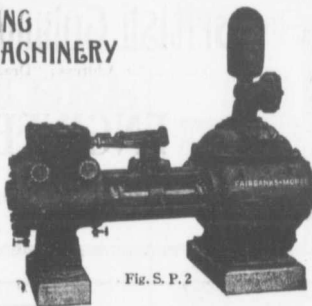
Fig. S. P. 2

The Canadian Fairbanks Co., Limited MONTREAL TORONTO WINNIPEG VANCOUVER