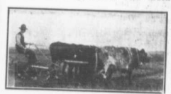
Breaking on the Western Prairies