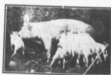
Thrifty Pigs in an Outside Run

Having been engaged in the production of hogs all my life, to some extent, but more particularly and extensively during the past 15 years, I venture to offer a few seasonable hints as to my method of feeding and caring for pigs at this season of the year. I like to have all my breeding sows, as well as stock boars, out on a nice piece of clover as early as possible in the