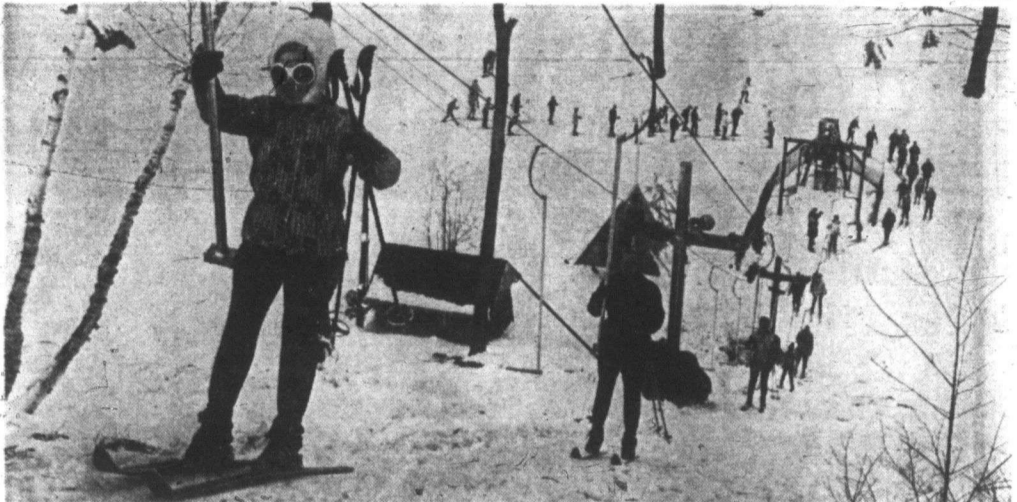
Ski slope opened at Oneida club on Mississauga rd. Saturday. It is fully equipped for winter fun.

McCLINTOCK'S PHARMACY LTD. DUNDAS HWY. WEST, COOKSVILLE, 277-1421