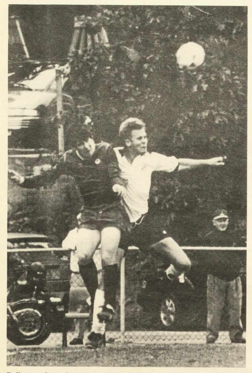
Dalhousie player (in white) collides with SMU Rival at Wickwire Field.