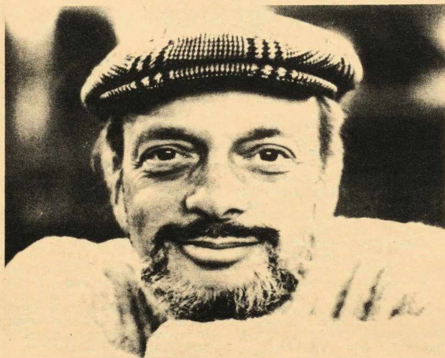
Hal Prince, Tony award-winning director/producer of some of Broadway's most prestigious musical theatre productions, will be speaking at the McInnes Room, SUB, on Monday, October 17, at 8:30 p.m.

includes some nicely-executed and pleasant cinematic effects.