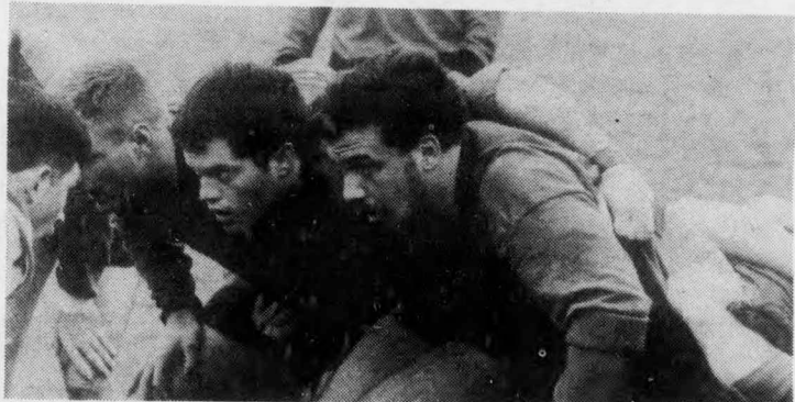
Front Row of Ironmen A.

They met the Mount Allison Mounties in the final on Sunday. The Ironmen forwards dominated their opponents with lengthy rolling mauls and vi-