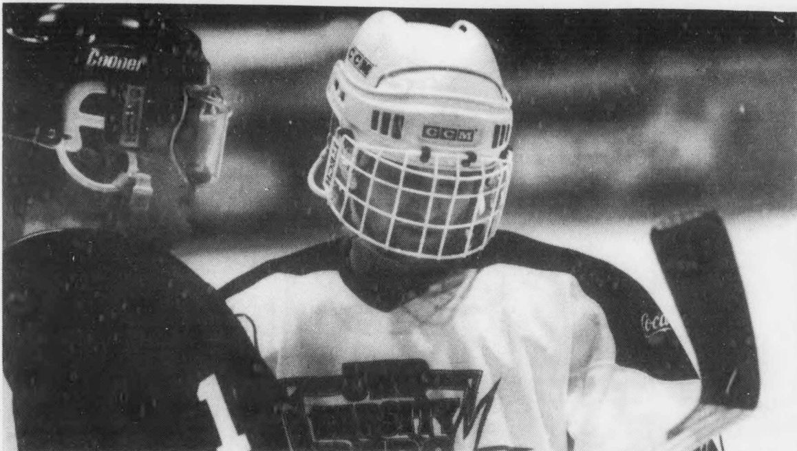
"So I got this really good stick deal at Crappy Tire."