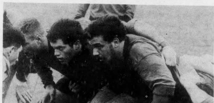
Front Row of Ironmen A.

They met the Mount Allison Mounties in the final on Sunday. The Ironmen forwards dominated their opponents with lengthy rolling mauls and vi-