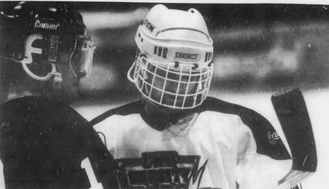
"So I got this really good stick deal at Crappy Tire."