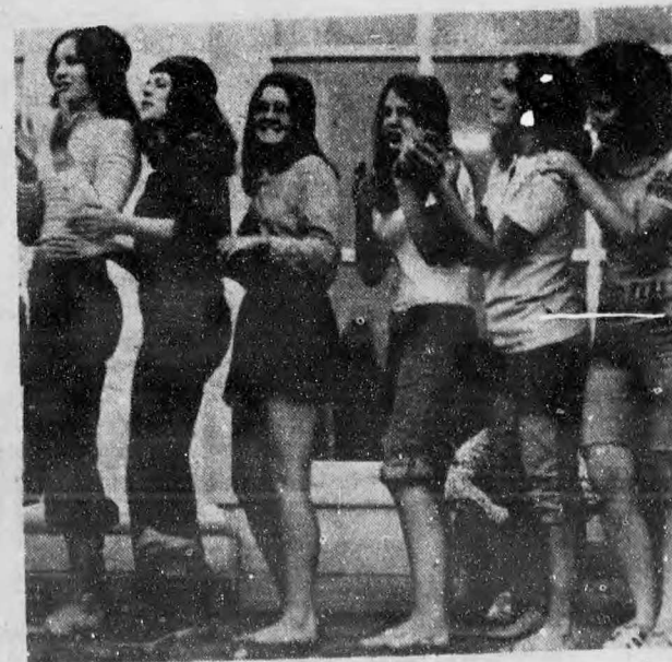
.....And the frosh (or yet the freshettes)—We'll see a new batch in the fall! ! ! !