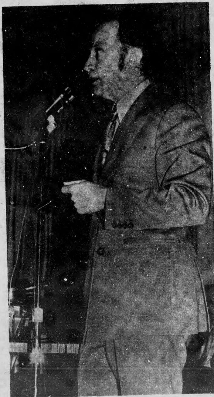
Trudeau graced the campus with his presence just before the federal election in October.