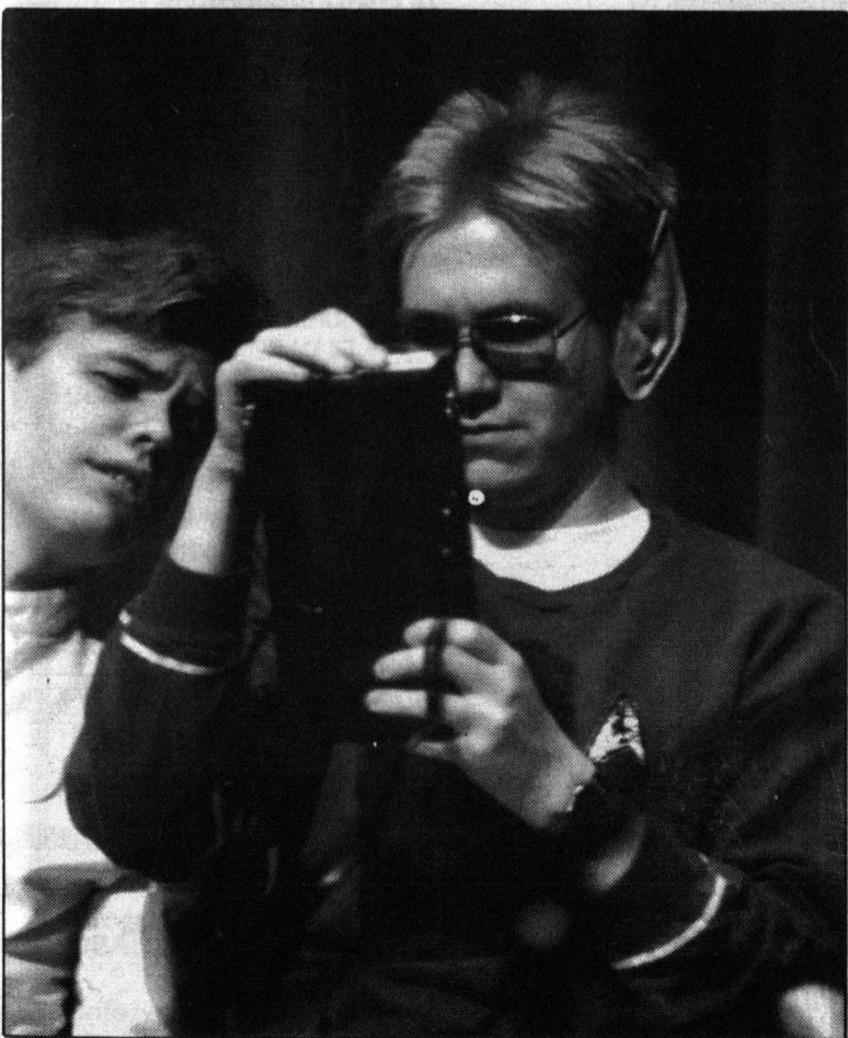
Mr. Spock failed to find intelligent life in election forum Wednesday.