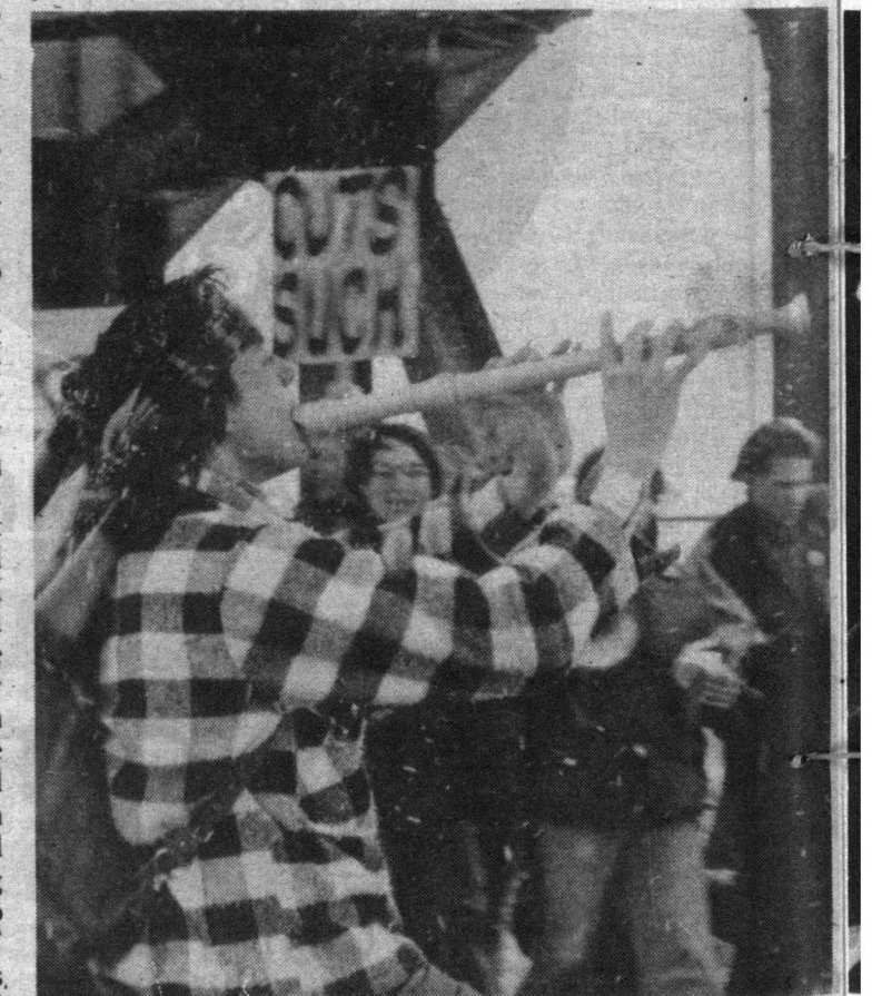
The Pied Piper of Edmonton led the march