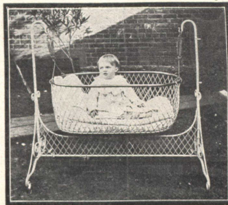
THE LITTLE BEAUTY HAMMOCK COT

Double springs attached to the bassinette hang from the standards and respond to the slightest movement of the child.