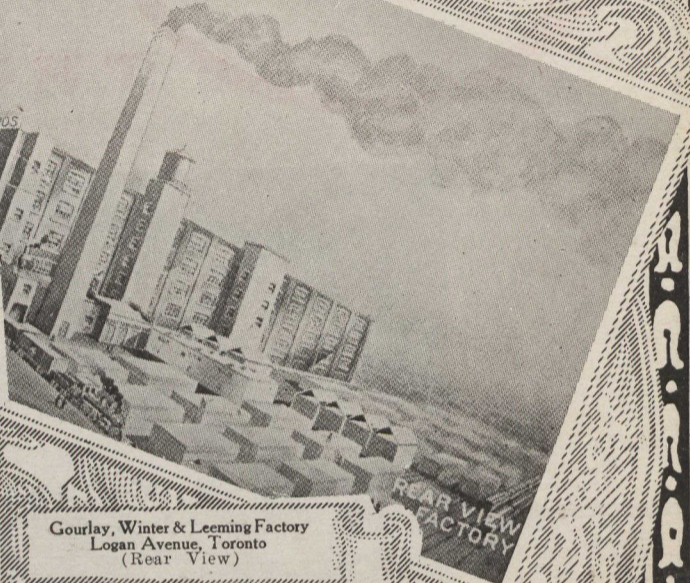
REAR VIEW FACTORY