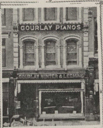
Waterrooms and Head Office 188 Yonge St., Toronto