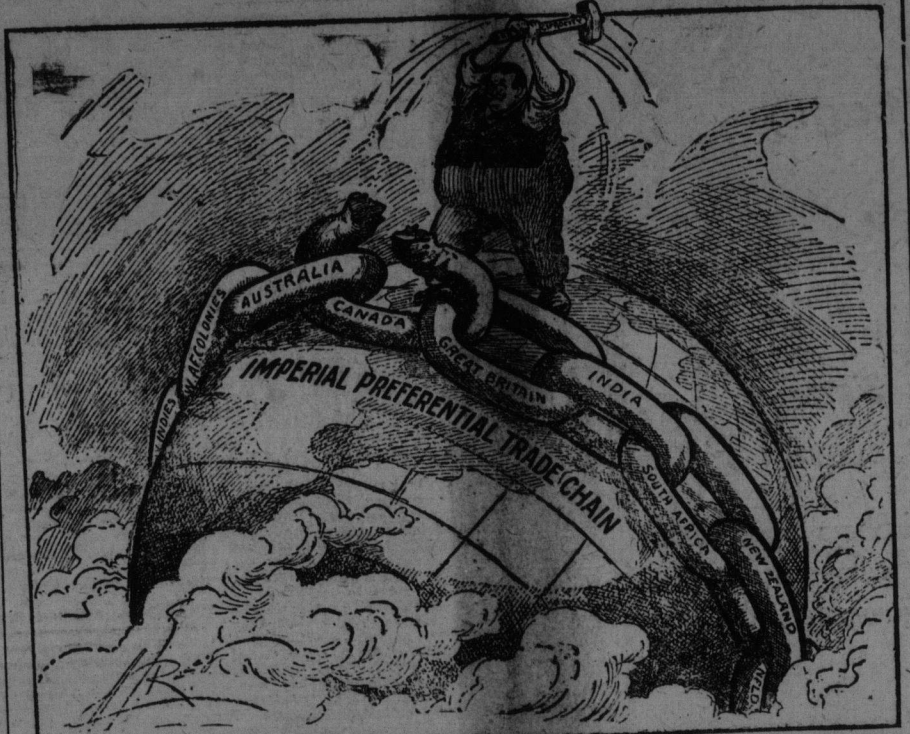
PRESIDENT TAFT:-THE BOND UNITING THE DOMINION WITH THE MOTHER COUNTRY IS LIGHT AND ALMOST IMPERCEPTIBLE.

From President Taft's message to Congress with the Reciprocity Agreement, Jan. 26, 1911: "Ought we not then to arrange a commercial agreement with Canada, if we can, by which we shall have direct access to her great supply of natural products without an obstructing or prohibitory tariff?... The Dominion has prospered. It has an active, aggressive and intelligent people. They are COMING TO THE PARTING OF THE WAYS."... "Should we not now, therefore, before their policy has become too crystalized and fixed for change, meet them in a spirit of real concession, facilitate commerce between the two countries and thus greatly increase the natural resources available to our people?"