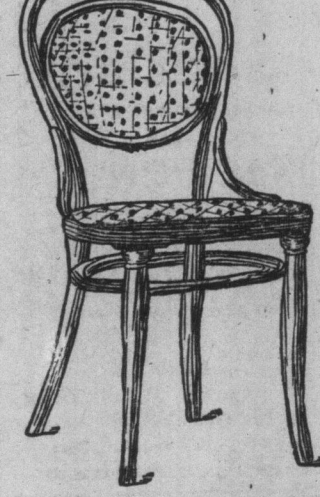
No. 517 —Austrian Bent Wood Chair, —oval seat, oak finish, $4.00; —mahogany, $8.75.