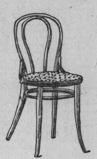
-Austrian Bent Wood Chair,