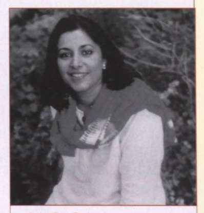
Anita Rau Badami