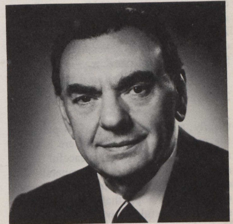
Donald C. Jamieson

We must urge those who wish to stand in the way of such a noble enterprise to reconsider their decision. The South African Government must realize that its defiance of the will of the international community, particularly when that Government has been so closely involved in a long negotiating process, cannot be tolerated. The new Government of South Africa, which we understand will be formed by the end of this month, would be seriously mistaken if it assumed that its actions in respect of Namibia will have no serious consequences. To those leaders inside Namibia who are being led to believe that they can solve their problems through some sham electoral procedure, I can only say: think of the future of your