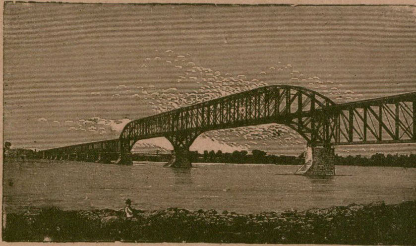
ST. LAWRENCE RIVER BRIDGE, CANADIAN PACIFIC RAILWAY, LACHINE, P. Q.

For Railways and Highways, Iron Bridges, Turntables Iron Piers and Trestles Bridge Rods Right and Left Hand Sleeve Nuts and all kinds of Structural Iron Work.