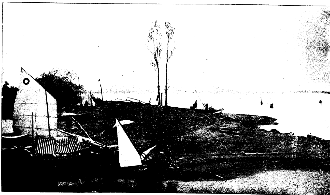
THE TORONTO CANOE CLUB.—MOUTH OF THE ELOBICOKE RIVER.