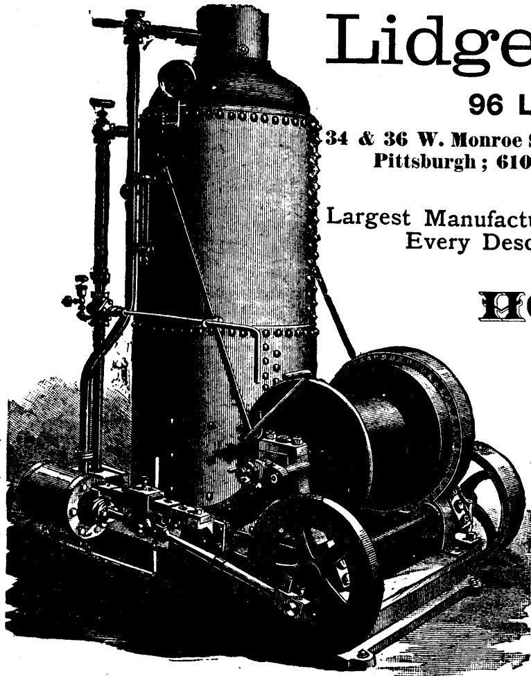
Friction Drum Portable Hoisting Engine.