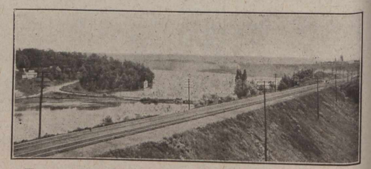
Fig. 4.—The End of Burlington Bay, Looking South Toward Hamilton, Showing the Valley Inn Road and the G.T.R. Fill.

Other details which enter into a comparison of the two routes are given below. In order to reduce them to