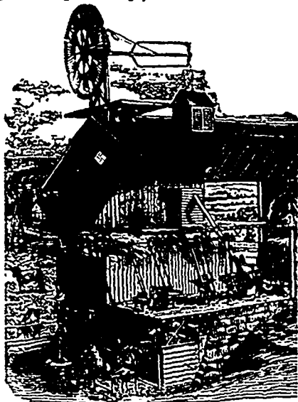
Geared Wind Mills, for Driving Machinery, Pumping Water, etc. From 1 to 40 horse power.