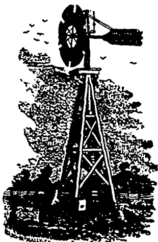
Holiday's Standard Wind Mills, 17 Sizes.

State what you want and send for Illustrated Catalogue.