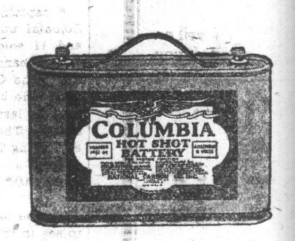
Columbia Hot Shot Batteries contain 4.5 or 6 cells, in a neat, water-proof steel case.