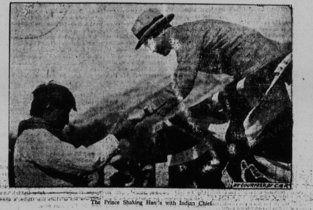
The Prince Shaking Han's with Indian Chief.