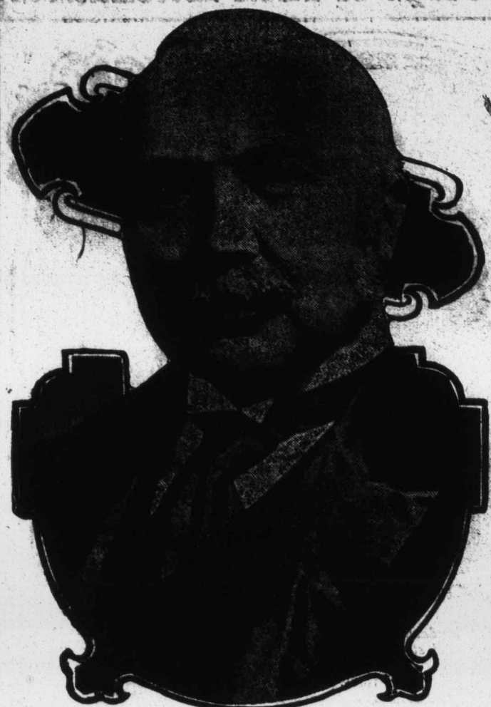
Sir Henry Campbell-Bannerman, the British Premier, who was over-come yesterday with sudden attack of heart spasm.