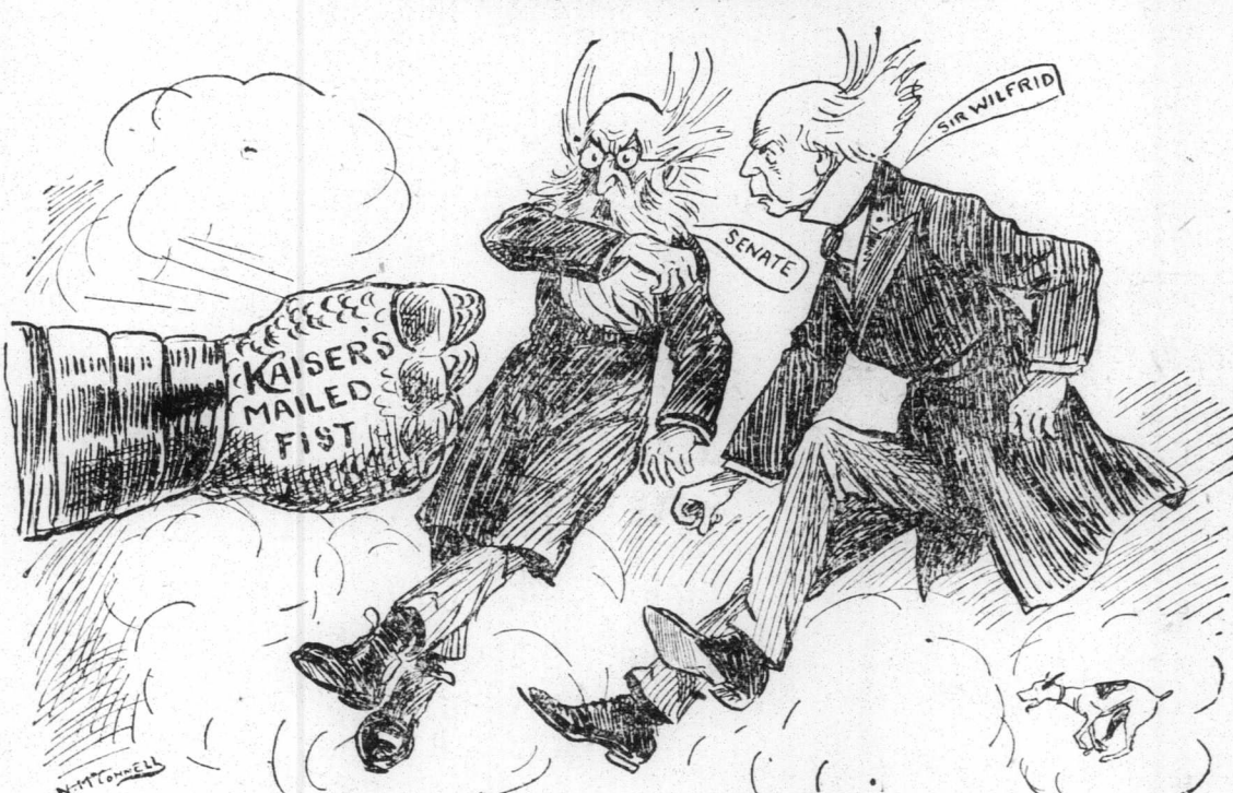
The "Emergency" Sir Robert Borden warned them to help him prepare to meet.