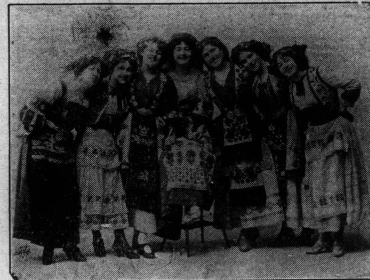
A CHORUS SCENE FROM "THE CHOCOLATE SOLDIER," AT THE GRAND, WEDNESDAY, DEC. 23.