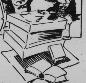
Sports in Their Proper Place. College Head—"And sports have their proper place in our curriculum, of course." Student's Dad—"Glad to hear it, glad to know my boy will have some chance to study, you know."

Of the fifty-two varieties of winter wheat grown under test in the past year the thirteen (13) highest yielders were all produced at the O.A.C. through hybridization and selection with but two exceptions, namely, Dawson Golden Chaff which came fourth and Red Rock which came tenth.