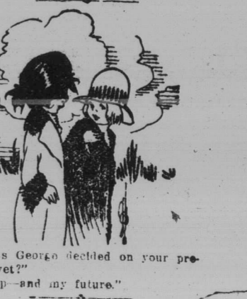
"Has George decided on your present yet?" "Yes—and my future!"

Scientists claim that turkey meat has a much larger percentage of protein, or flesh-forming food, than beef. It is more easily digested, because the fibre is shorter and yields more readily to the digestive process. Beef contains a high percentage of extractive matter which is nearly entirely lacking in turkey.