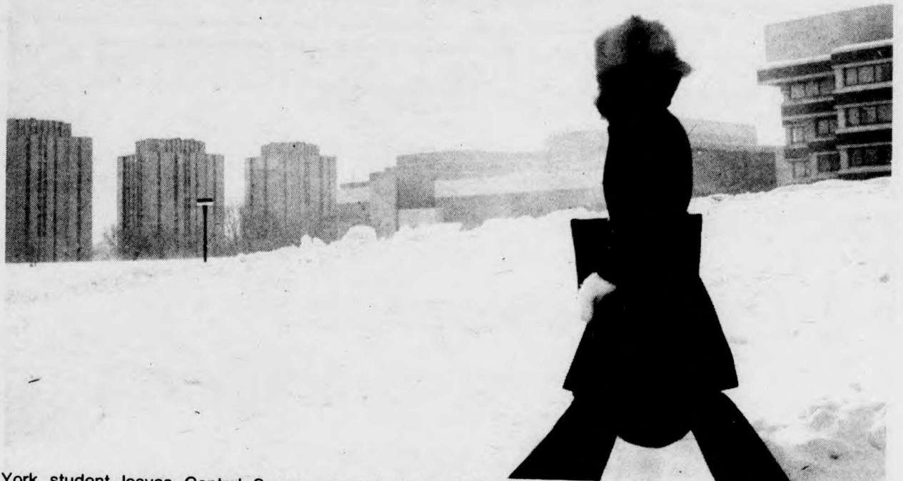
York student leaves Central Square on way to graduate residences (background). York may soon build a fifth residence.

"In any case," he said, "we'll have to consider the proposal very carefully. There is not much building going on these days, and you certainly don't want to make a mistake in what you do build."