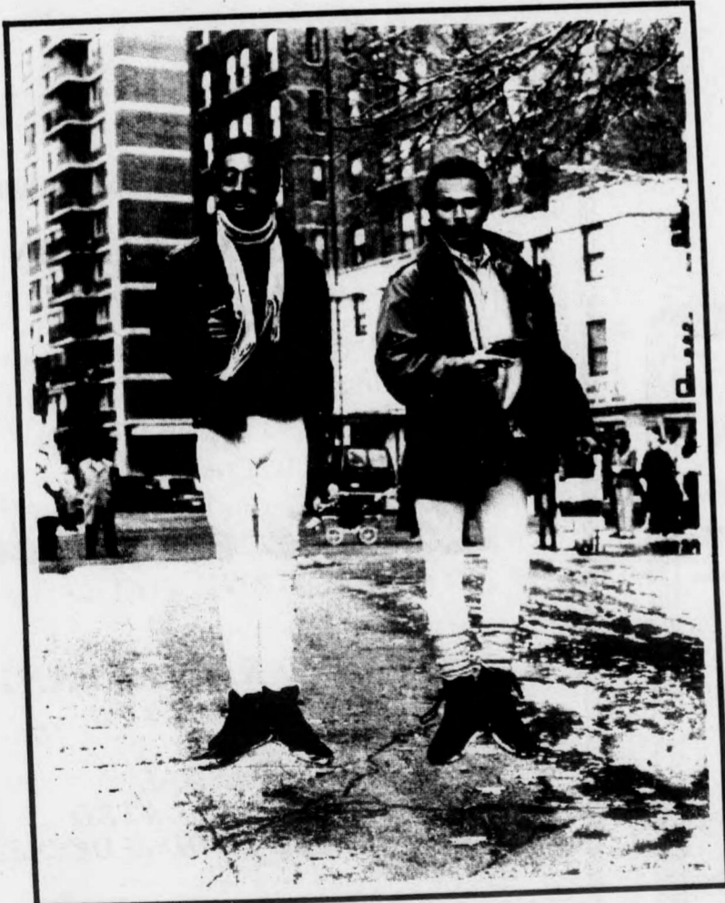
w/Gregory Hines, Billy Crystal

FREE to the UNB Community U.N.B. I.D. required