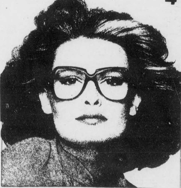
• prescription eyeglasses