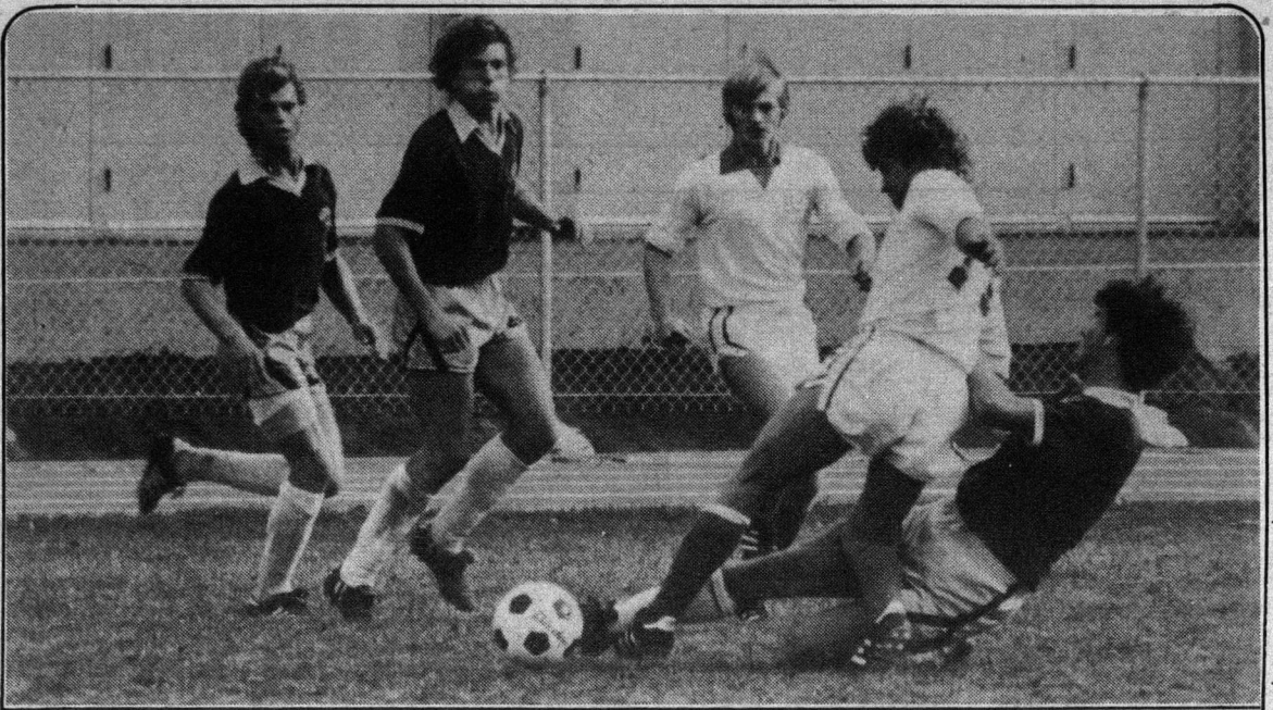
Scoring problems are a distant memory for the soccer Bears who have scored 10 goals in their last 3 games. Story page 13.

If you follow these suggestions you should find cold-weather running an invigorating experience.