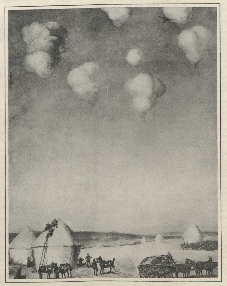
Even a haystack is an aid to riflemen in bringing down aircraft. A modern rifle can kill an aviator at 3,000 feet and disable him at 6,000.

less than that required for a warship. Admitted that a Zeppelin could make the round trip from a coast base and back on her charge of fuel, or say 400