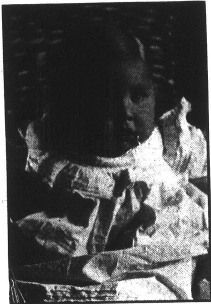
FIRST WHITE BARY BORN AT MELFORT, SASK.

A great deal of quiet fun is missed if you do not have pet animals about the house and watch their games and antics. A cat and her kittens will furnish many a hearty laugh if you cultivate the habit of watching them. The other day I was waiting for a friend